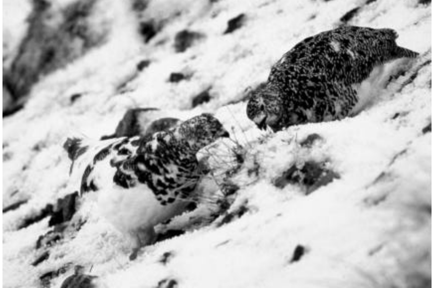
Fig. 3. Male (l) and female (r) white-tailed ptarmigan in cryptic spring breeding plumage feeding on alpine territory, Loveland Pass, Colorado.

as much as possible from predators and extremes of wind, precipitation, or temperature. Rosy finches and mountain bluebirds ( Sialia currucoides ) nest in inaccessible cliffs or rock crevices, while pipits and horned larks nest on open grassy tundra slopes that are potentially more exposed to predators and climatic extremes. Johnson (1965) reported 81% of 139 rosy finch nests were in cliff crevices, and suggested that rodents might limit rosy finch nesting to cliffs. Nest sites in cliff crevices and under rocks are colder thermal environments than open cup nest sites in the alpine and arctic tundra (Lyon and Montgomerie 1987, Wiebe and Martin 1997). Water pipits ( Anthus spinoletta ) in Austria spent three to