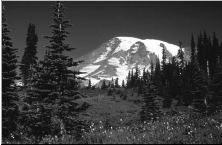
Fig. 1. Sub-alpine flowers in the foreground, open montane forest with hints of tree 'islands', and a spectacular view of snow-capped Mt Rainier in the background. Slide by Steve Ogle (#17), mid to late August 1999.

climates are characterized by high winds, low temperatures, low effective moisture and short growing seasons (Braun 1980, Billings 1989). Alpine zones increase in elevation from north to south and from coastal areas to interior. Northward across the mid-latitudes of North America, treeline decreases about 152 m (500 ft) in elevation per 160 km (100 mi, Daubenmire 1954). In the Cascades, treeline increases in elevation from about 2000 m (6560 ft) on the west side to 2500 m (8200 ft) on the eastern continental side (Arno 1984). In this chapter, the alpine zone includes two habitat types, alpine treeless and partially vegetated areas at the top, and the sub-alpine, which is the zone between closed upper montane forest and the upper limits of small trees in open parklands.