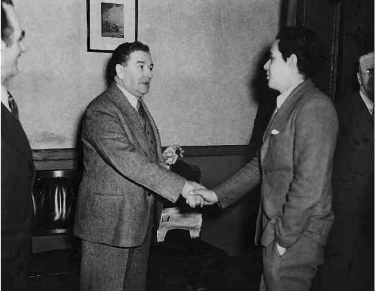
André Mathieu and the Quebec Premier Maurice Duplessis, [ca. 1946]. All rights reserved. Commercial reproduction is prohibited.

File containing mainly photographs of André Mathieu with family members and friends. The file also contains two photographs of André Mathieu with Maurice Duplessis.