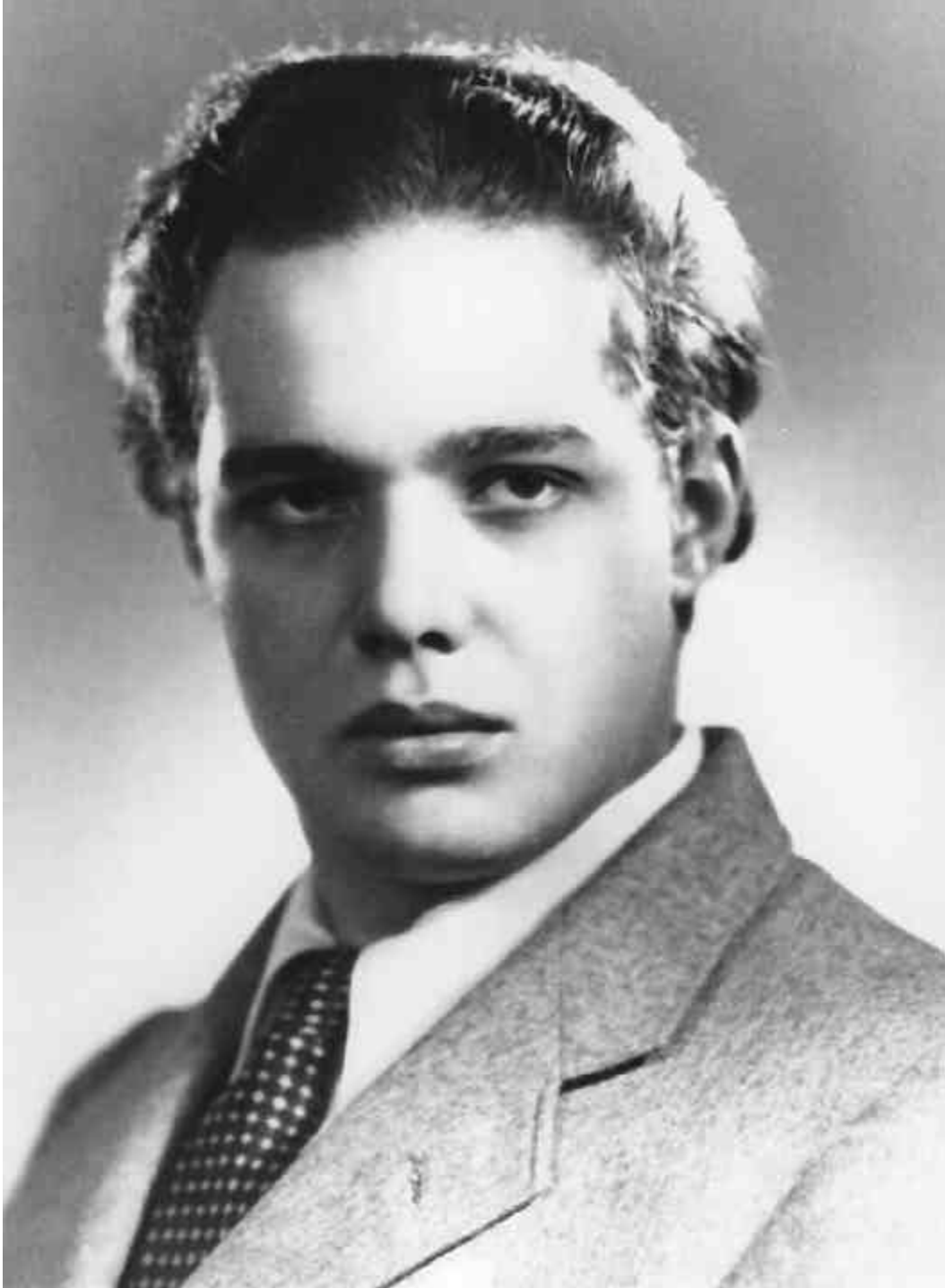
André Mathieu, [ca. 1946]. All rights reserved. Commercial reproduction is prohibited.