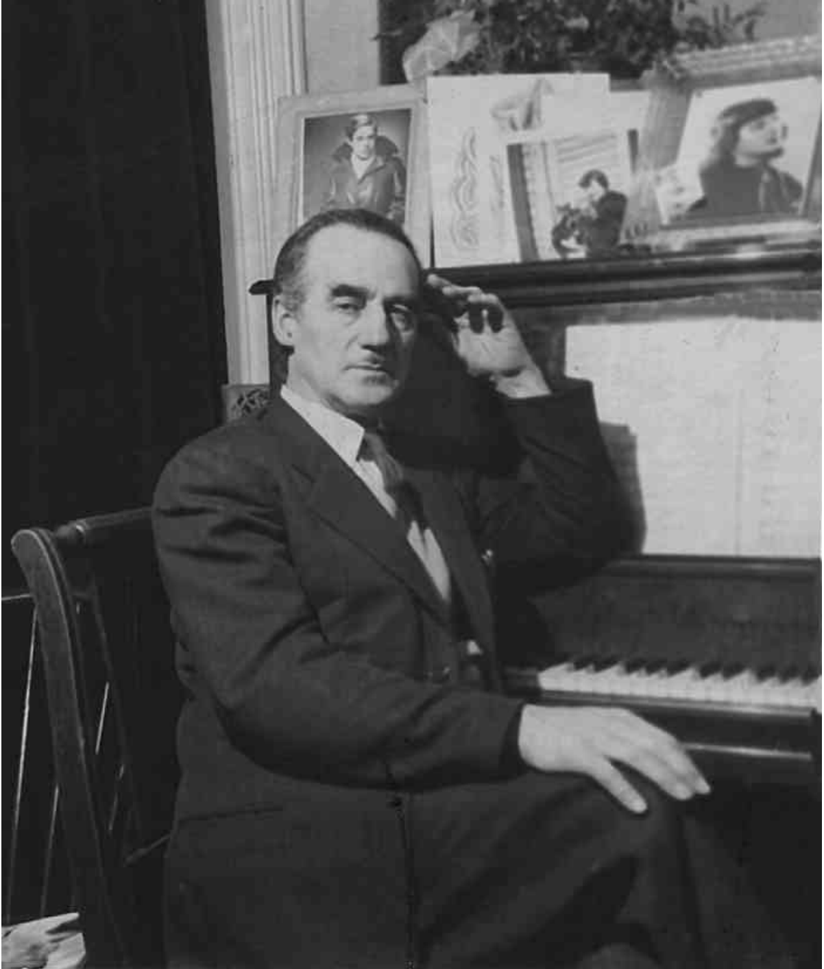
Rodolphe Mathieu, Montreal, [ca. 1950]. All rights reserved. Commercial reproduction is prohibited.