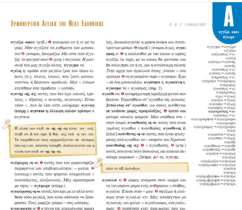
Figure 2: Sample page of the GHSD

The described lemma organization contributes also to a much desired lexicographical goal, namely economy in space (see also sections 6 and 8). However, it also poses a burden on users, who find it difficult to spot the word they are looking for and might be, therefore, discouraged from further use of the dictionary. For this reason, the alphabetical index has been introduced to the dictionary: it appears on the side of each page (Figure 2), includes all the lemmas and sub-lemmas in alphabetical order, and directs the user to the appropriate lemma where these are located. It also contains difficult inflected words (distinctively marked), common misspellings and spelling variants, in order to facilitate dictionary lookup.