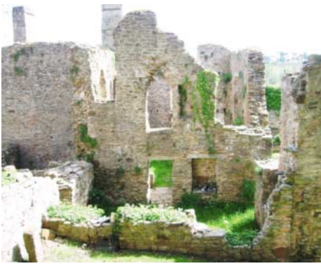
Waddeton Court, one of the manor houses visited by the DRA archaeological team.

The significance of the site at Shilstone, near Modbury in south Devon, is the survival of a truly remarkable and