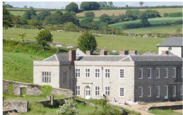
Shilstone, 2009: restored house with barns in the background and part of walled garden in foreground.