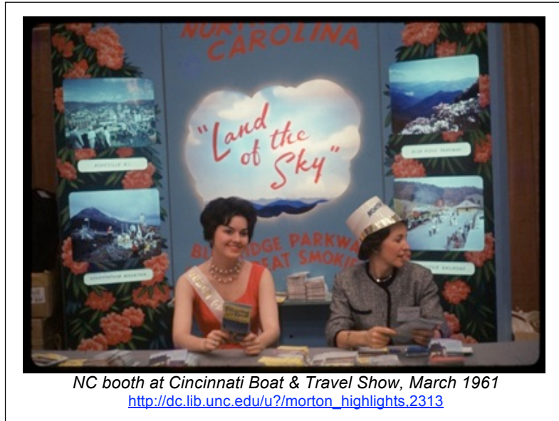
NC booth at Cincinnati Boat & Travel Show, March 1961 http://dc.lib.unc.edu/u/?morton_highlights.2313

drawn leisure travelers for quite some time. In the early nineteenth century, wealthy planters such as Wade Hampton and future Confederate treasury secretary C.G. Memminger sought solace from “the fever season” at North Carolina retreats in places like Cashiers and Flat Rock. Communities like Hot Springs became bustling tourist destinations before the Civil War. After the war, tourism emerged anew. While some North Carolina communities turned to textiles, tobacco, or furniture as routes to post-