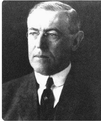
Woodrow Wilson