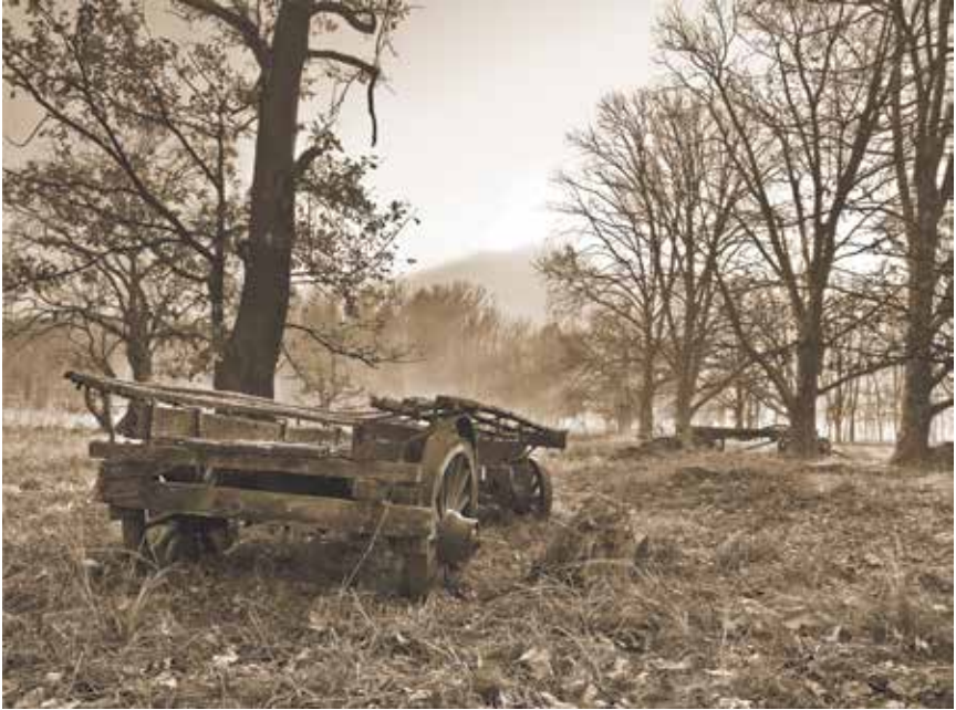
“Right away at the far corner is the wagon road that leads to Maritzburg.”