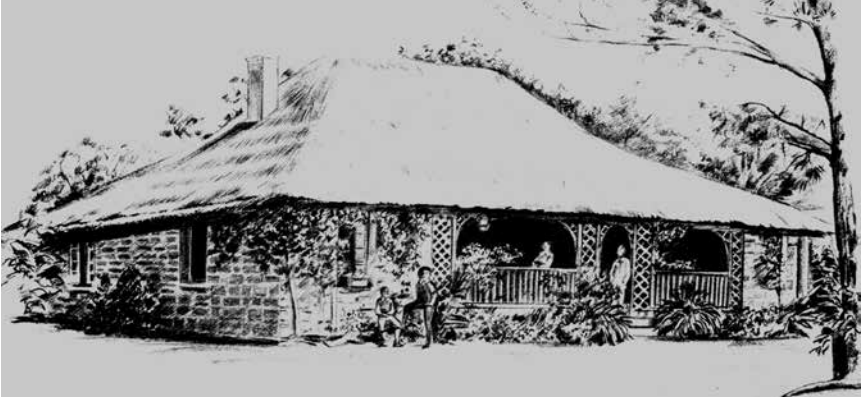
“Uncle Robert was sitting on the verandah smoking while he watched Miss Emery doing crochet work.”

and the “Pilgrim’s Progress” with beautiful pictures.