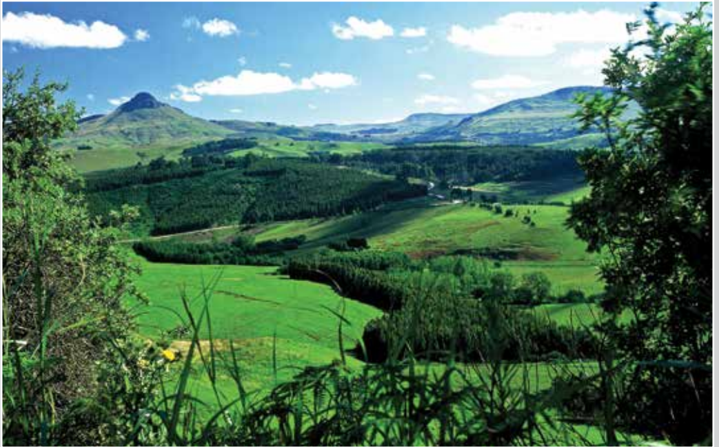
“Father’s plantations stretched away across the landscape as though painted in olive green on a grass-green background.”